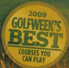
The Pete Dye Course at French Lick Resort French Lick, Indiana